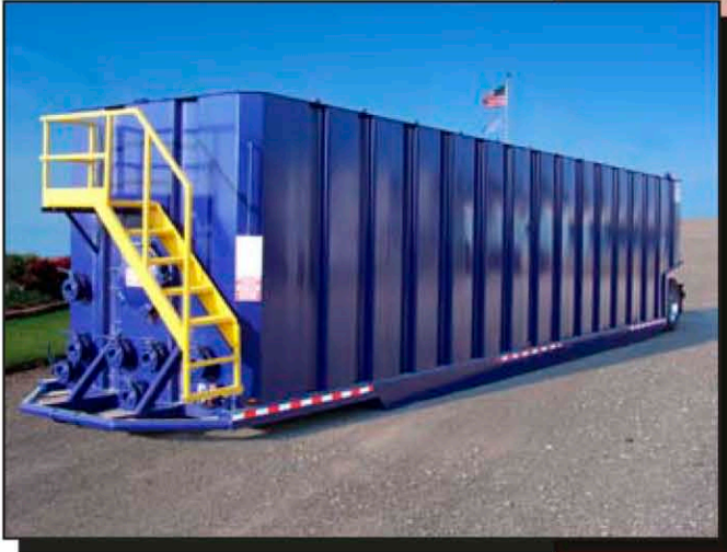
500 BBL Flat Top Storage Tanks