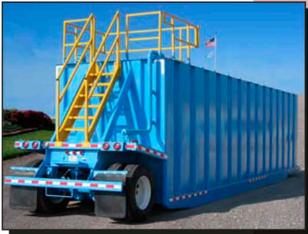
390 BBL Double Wall Storage Tanks