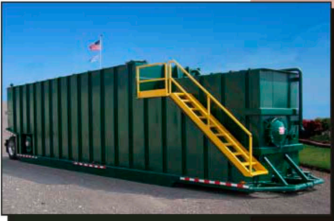
490 BBL 'Side Step' Storage Tanks